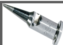
Spare tip with 1.6 mm point