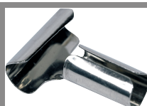
Deflector nozzle for heatshrink sleeving