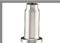
Heat blower for gas soldering iron